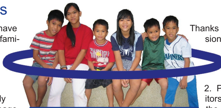
Our CSC Circle of Prayer