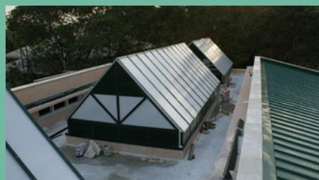
Duterte Home skylights