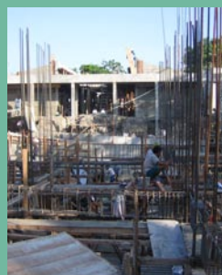
Left: Beams are completed on first level as floors are being laid.