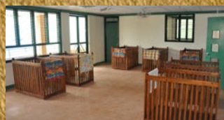
New Buildings - 3