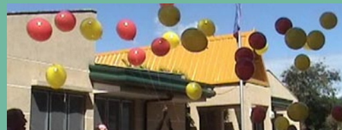
Below: Campaign kick-off in Cebu. Right: Wall and road project begun. Far right: Footings poured