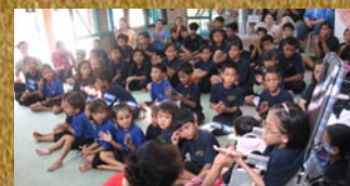
School Opening - 5