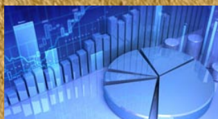
Financial Report - 2