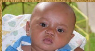
Kid's Korner - 4