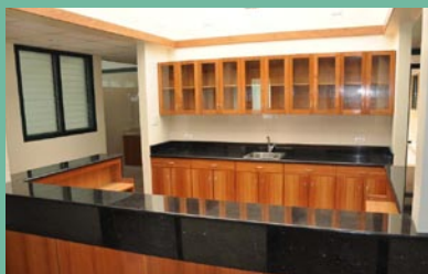
Nurses central station