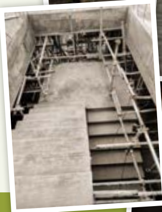
STAIRS TO SECOND FLOOR