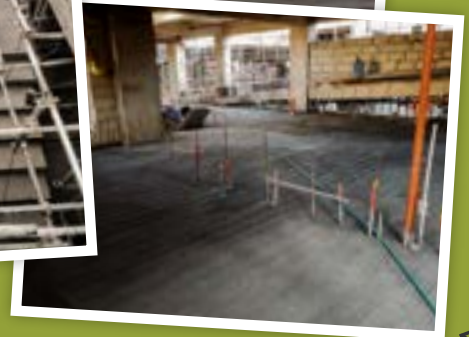
ROOMS ARE STARTING TO COME TOGETHER!