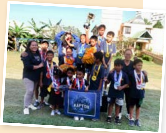
The Royal Blue Raptors

CCHS Sports Fest 2024, our regular sports competition event, includes students aged four to fourteen years old, ranging from preschoolers to sixth graders. The committee divided the students and teachers into two teams based on their grade level and ability to play.