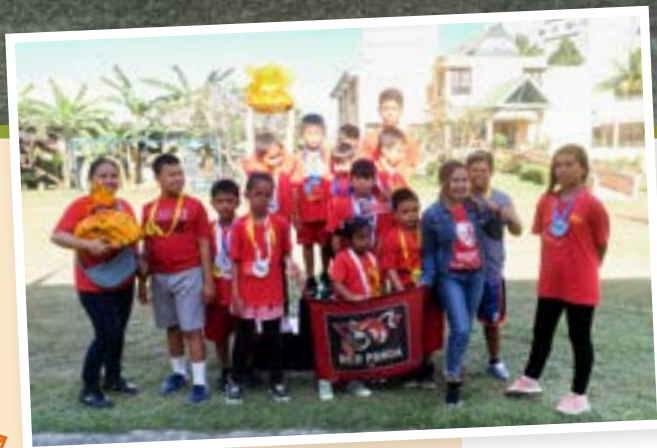
The Red Pandas