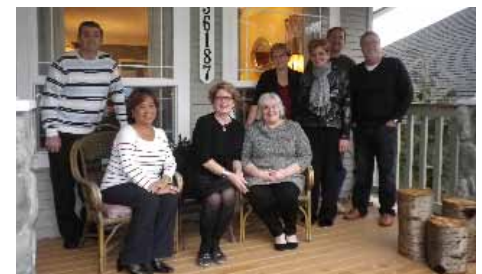
CCSCC Board Members:

try of CSC and how we can have a part in it." The evening's offering will go towards medical and child care needs of the children in Cebu.