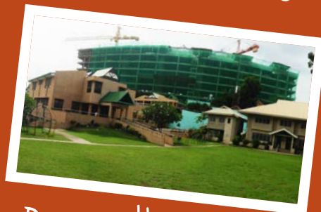
Our new neighbors ↗

our shelter and school is not guaranteed to stay that way. We've kept in touch with the owners, who maintain they aren't ready to sell, but we need to get ready for the moment that changes. Our board has talked about that as one of our highest priorities. We figure this land will be worth $750,000—so this is no small priority.