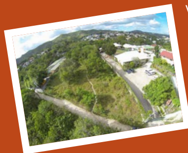
The land we pray ↖ God intends for CSC