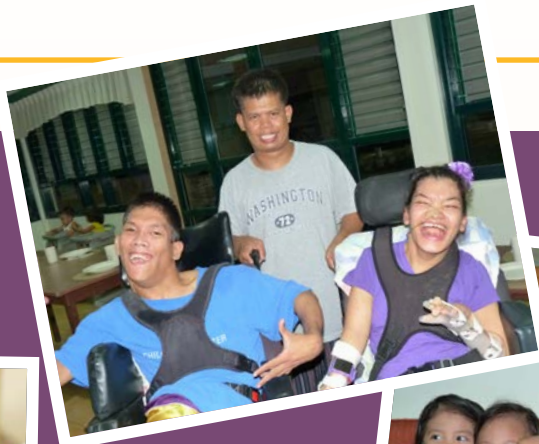
Leaving Soon ↘