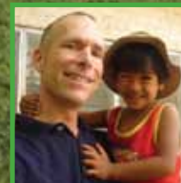
Matt Buley's Column Page 2