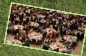
CSC Banquet April 28 Page 2