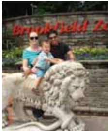
Bong and family live in Minnesota, USA.