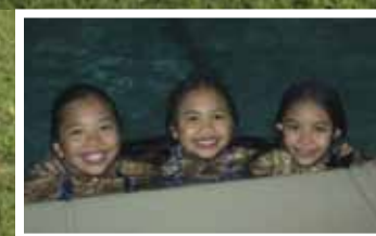
A Banquet Story Page 5