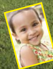
Kids' Korner Page 4