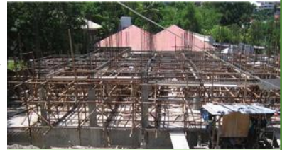
Above: Jacob's House for special needs kids.

Gifts to our campaign give hope for the completion of these buildings and for all the great ministry opportunities they will provide in the years to come.